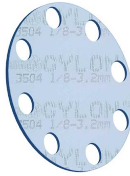
Blind Flange Gasket without ID (not recommended)

This practice of using a solid ID is NOT RECOMMENDED , however, for several reasons.