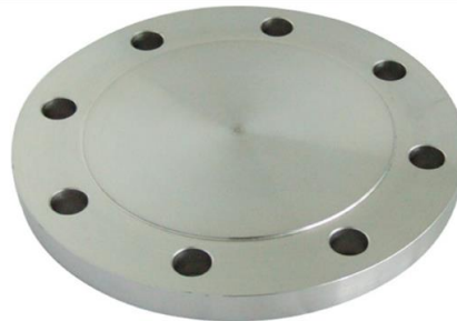
Raised Face (RF) Blind Flange

A common request for gaskets with a blind flange is for a gasket with no ID; a gasket with a solid center. The customer might ask for these solid gaskets with bolt holes or without. If the blind flange is a standard ASME flange, the OD of the gasket will be the same as the OD of the standard ring or standard full face gasket. Many times, the customer expects that the solid gasket will protect the blind flange from the fluid in the system. They might be trying to save money by using a carbon steel (CS) blind in chemicals that require a more expensive metal, so they want the gasket to keep the fluids away from the low cost blind flange.