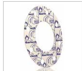
CUT GASKETS (4122-FC)