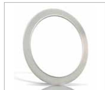
CORRUGATED METAL GASKET (4122-CMG)