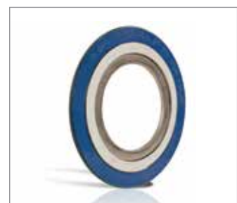
SPIRAL WOUND GASKET (4122-SWG)