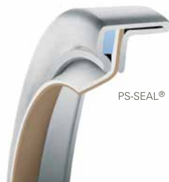
PS-SEAL® with reversed lip design